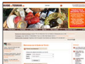
Guide du Terroir